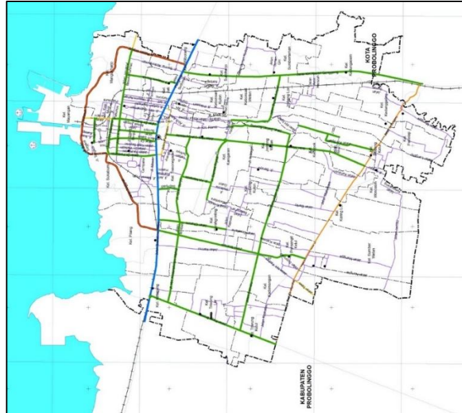
Figure 1 – Map of Research Locations

The main information required for this study is information on the physical characteristics of the land and grape growing management. This information was gathered by interviews, direct survey methods in the field, soil sampling at several locations on the grape farm, and laboratory testing of the samples. Utilizing a survey methodology, total data on income factors, fixed cost variables, variable cost variables, capital and other needs in fruit farming were collected from 166 respondents, who were fruit producers located in various sub-district locations. Based on the four criteria, survey data from the prior questionnaire was used to create the development model for the grape growing industry.