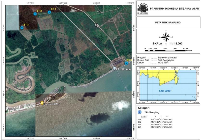
Figure 1 – Map of the location of the Water Quality Sampling Points at the location where the Vaname Shrimp Pond Demonstration Plot is planned to be made

The plan for making a Vaname shrimp pond demonstration plot is in the location of a former community shrimp pond that has been freed by PT. Arutmin Indonesia Asam-Asam Mine.